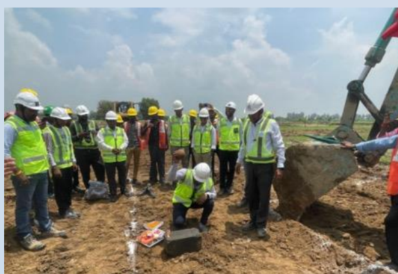
Excavation works at the Project site have begun after onboarding Tata Projects as the EPC contractor.